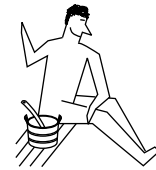
Sauna (10 - 15 min.)