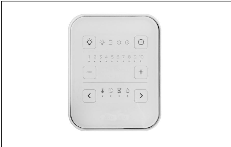
Sauna Control Models Trend, Trend Club, A30 and A30 Club (Type # 1601-31 and 1601-31-1)

Read all instructions carefully before installation. Please leave all instructions and warranty with the owner.